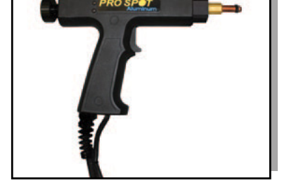
AL-5 Aluminum Stud Welder