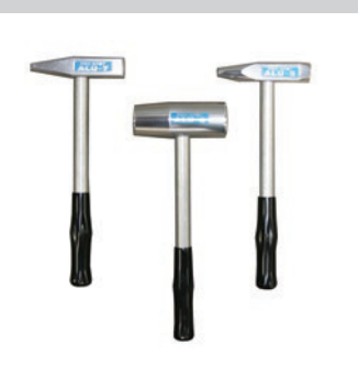
SA-0032 3 pc. Aluminum Hammer Set