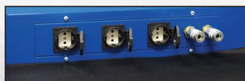
220V Utility Panel (Optional)