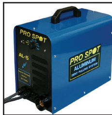
AL-5 Aluminum Stud Welder