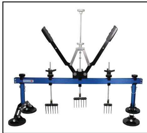
PB-20 Advanced Pull Action Adapter*