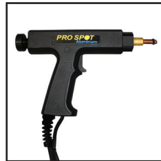
Stud gun with trigger